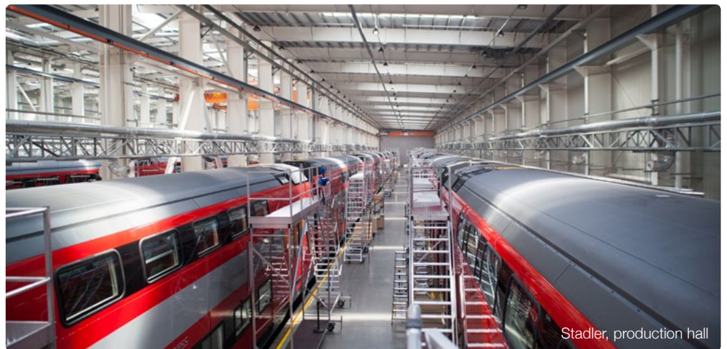
Stadler, production hall