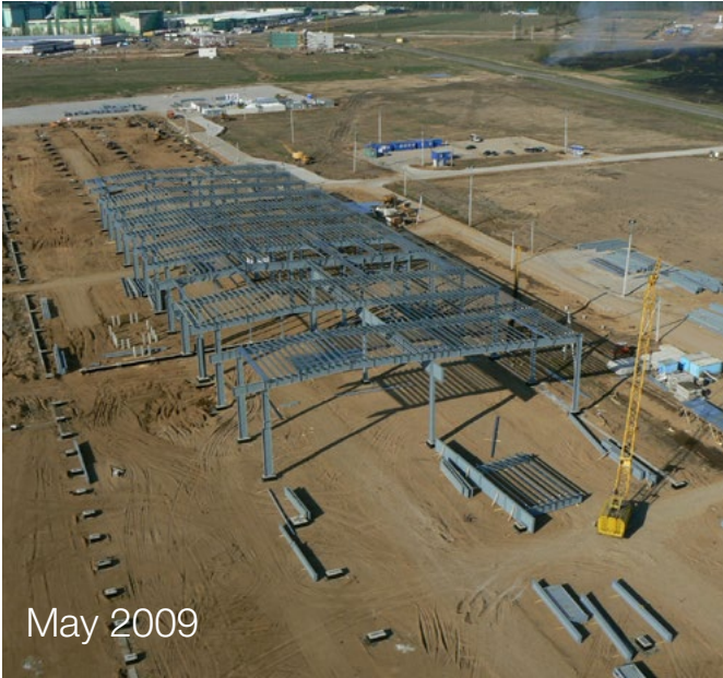
Start of the assembling of the primary and secondary frames