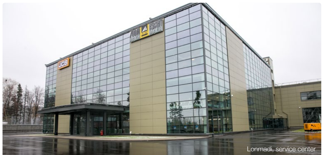
Lonmadi, service center