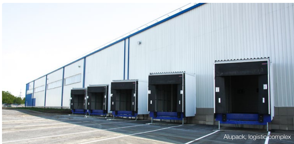
Alupack, logistic complex