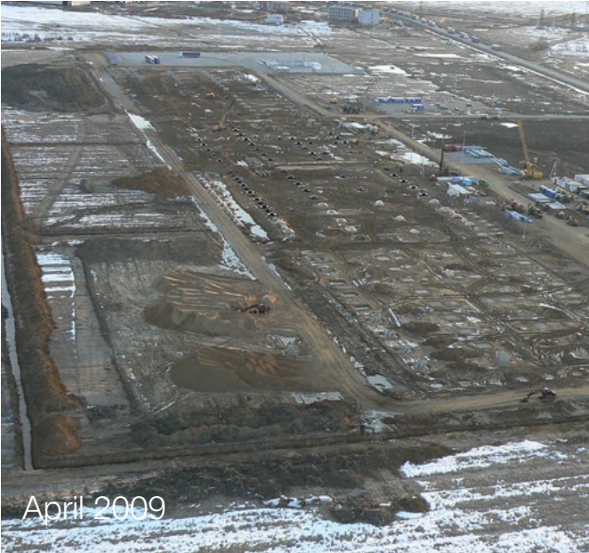
The foundations are ready

The square – 50 200 sq m – assembled in 4.5 months The building is equipped with 70 different cranes