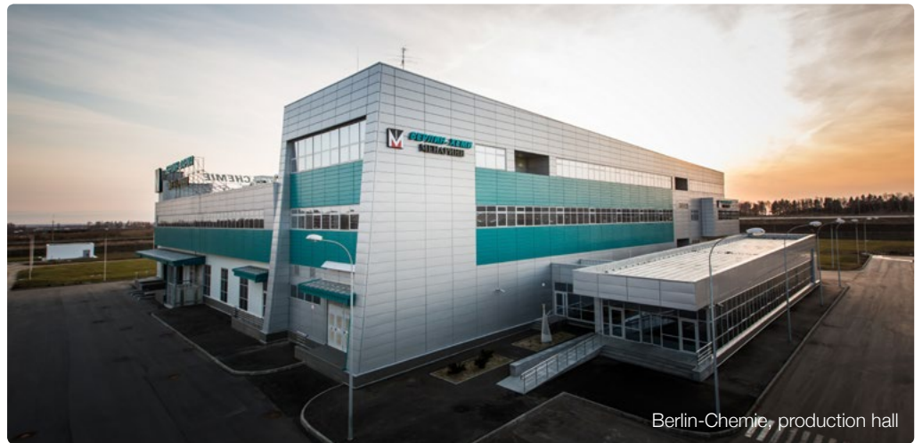
Berlin-Chemie, production hall