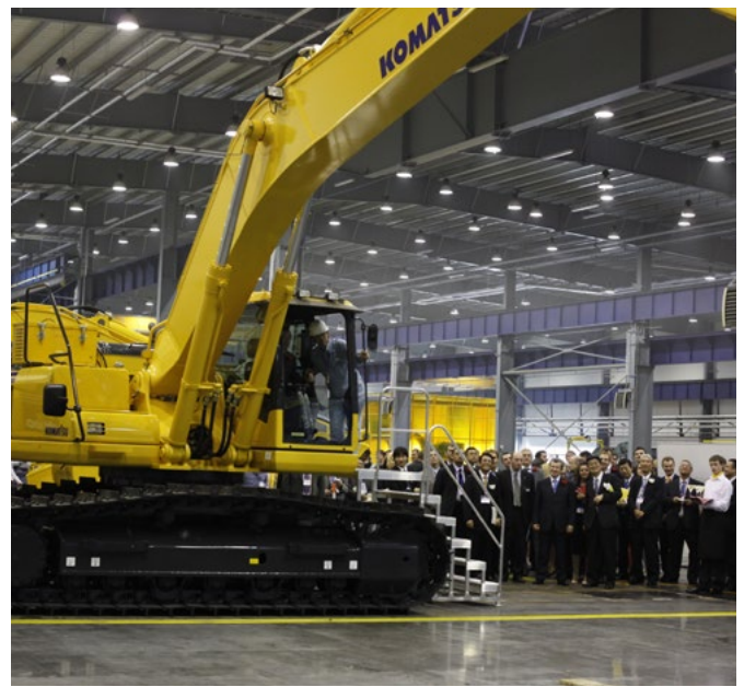
Komatsu Grand Opening