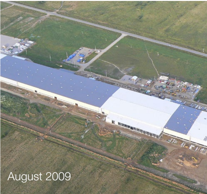
Assembling is finished