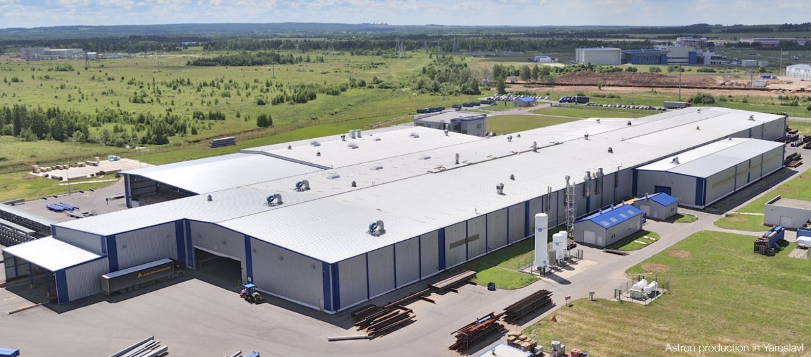
Astron production in Yaroslavl