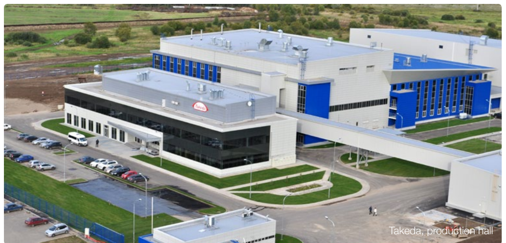
Takeda, production hall