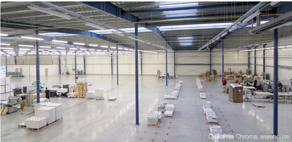
Drukarnia Chroma, warehouse