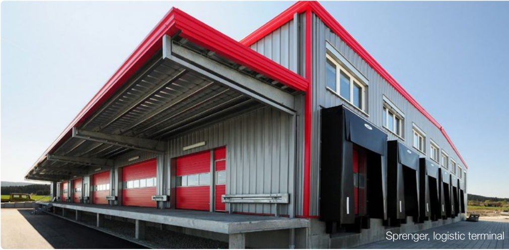
Sprenger, logistic terminal