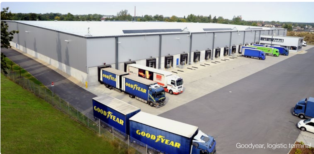
Goodyear, logistic terminal